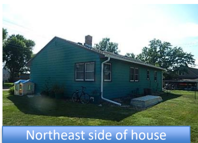
Northeast side of house