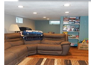
Basement Family Room