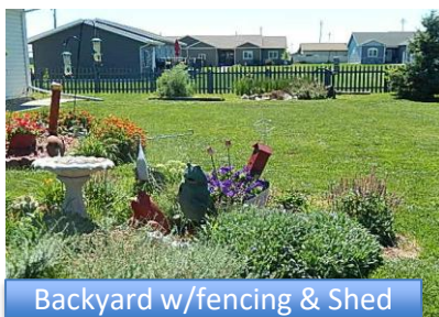
Backyard w/fencing & Shed

402 N Main Street Chamberlain SD 57325 CHAMBERLAIN REAL ESTATE PROFESSIONALS