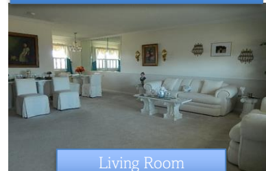
Living Room Dining Room