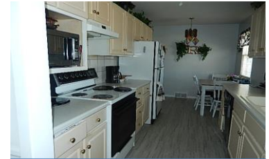
Kitchen & Breakfast Nook